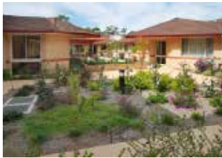
Cherrybrook Christian Care Centre