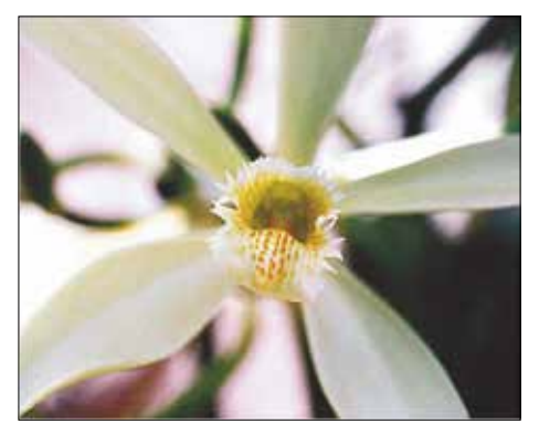
Vanilla Orchid (V. planifolia)

In 1836, Charles François Antoine Morren travelled down to Mexico to figure out why they weren't able to produce vanilla beans in Europe. As Morren was studying the vanilla orchids, his attention was drawn to a little bee (the Mexican Melipona bee). This bee landed on the orchid, lifted up the little hood-like membrane, collected pollen, and then flew off to the next flower. This bee was pollinating the orchids. After some time, the orchid produced a vanilla bean.