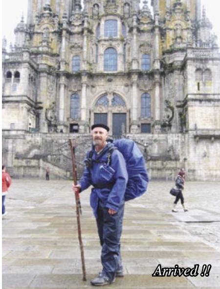
Cathedral in Santiago

themselves had just arrived in Santiago, was a wonderful experience.