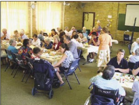
Lunch time after one of our monthly Tuesday Outreach Gospel Meetings

Other fruitful outreaches include: monthly, a Gospel Tuesday Outreach meeting (11.30am - 12.30pm) with an average attendance of 60. This is followed by lunch. Fortnightly, a Craft meeting and an English Language >