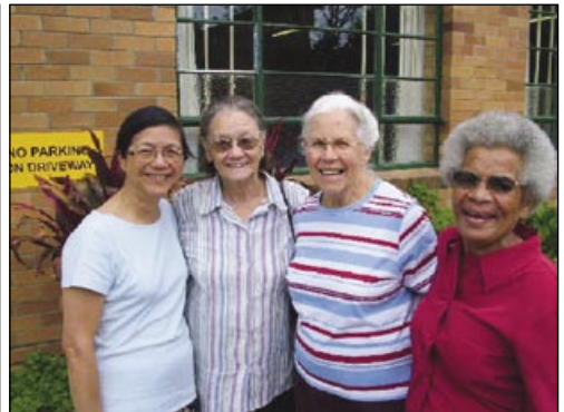
Sisters who meet monthly for prayer