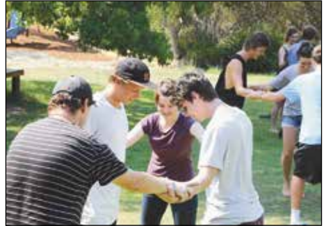
Team activities and challenges

The camp site is on Emmaus Road, Ingleside, NSW, and the phone number is (02) 9450 1296.