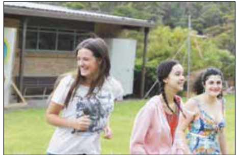
Plenty of fun