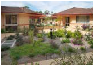
Cherrybrook Christian Care Centre