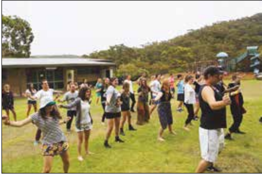
'Aerobics with a Difference!' on Leadership Camp

This year, 2014, has been a very happy one at Camp Kedron as many young people have passed through our doors and heard the Good News of salvation as well as having many exciting and fun experiences. We are particularly thankful for safety and protection of each camp worker, leader and camper, and we thank the Lord for His blessings upon us.