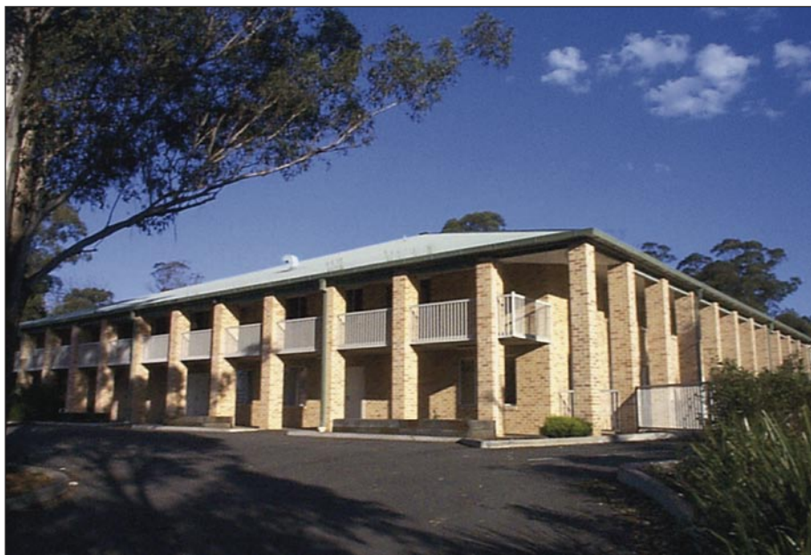
Riverstone Community Church of Christian Brethren 15 Hamilton Street Riverstone NSW 2765 (PO Box 189)