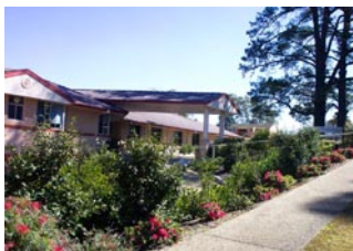
Cherrybrook Christian Care Centre