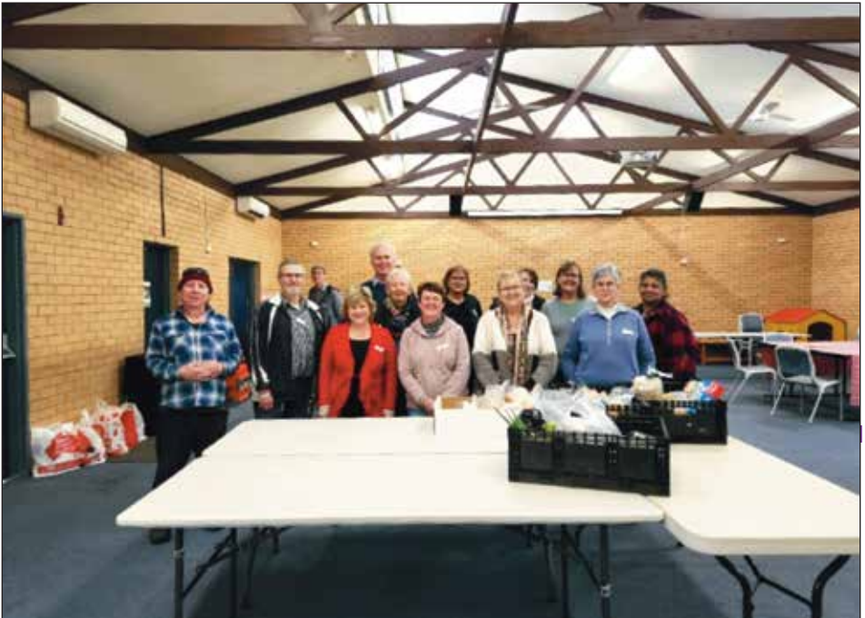
Some of our team for the weekly food distribution