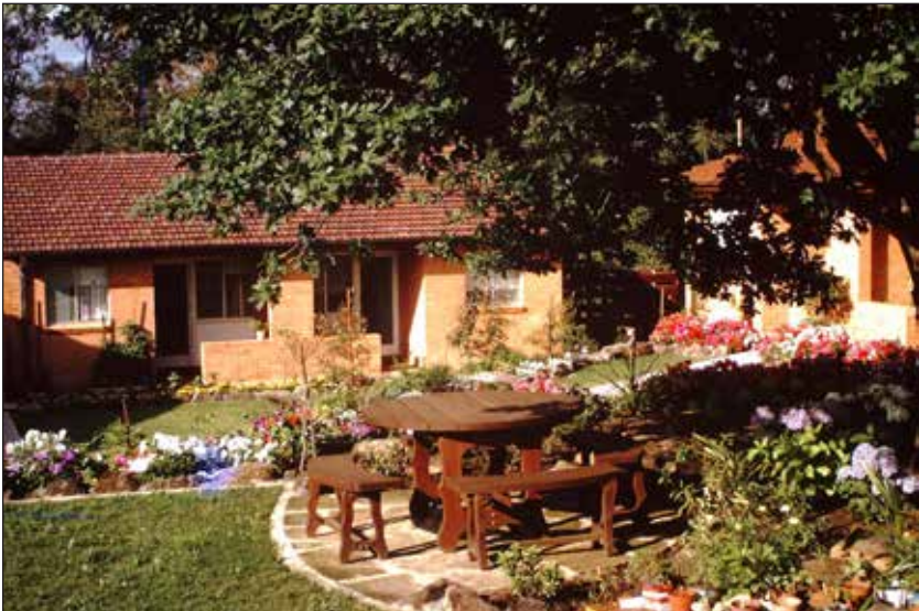
Later; Finished and Landscaped

It's rather ironic that the original Lutanda property was purchased by an independent developer who pulled down the old building and built (can you believe it) a retirement village!! They called it Lutanda Manor which was a nice and appropriate 'nod' to its original purpose, but somewhat weird that it was on the very land that FG first envisaged THIS retirement village!