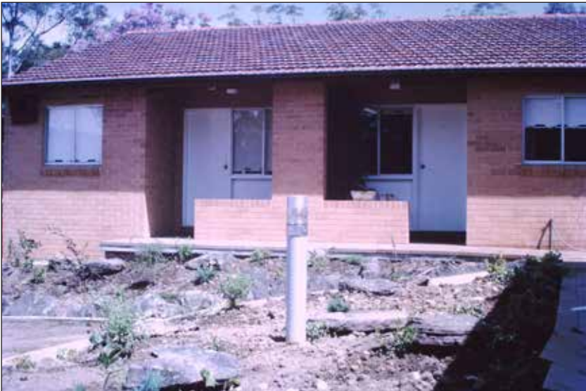
Nearly ready; some of the first Units to be built

In those days no one could simply start up a nursing home without initial exorbitant costs. However if one could transfer the licence from an existing nursing home facility one could bypass that costly outlay. As it happened, in God's timing, the Bethshean Nursing Home at Hurlstone Park had reached the full extent of its expansion capacity. Council height restrictions prevented building upwards and it had already