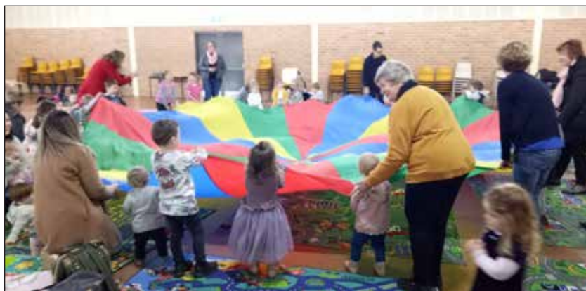
Our weekly music and playtime program