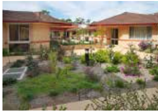
Cherrybrook Christian Care Centre