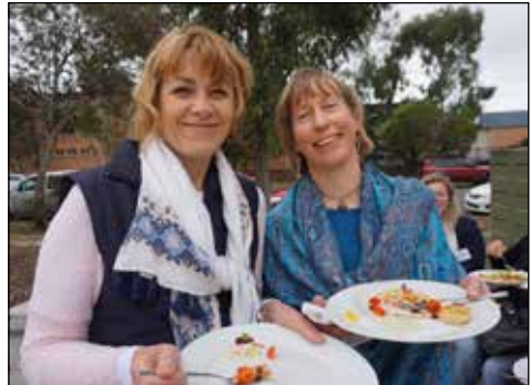
Friends sharing lunch and fellowship