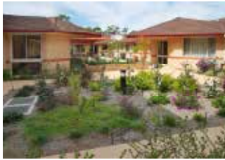
Cherrybrook Christian Care Centre