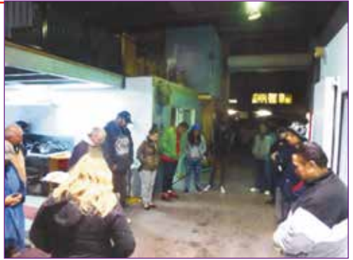
Distribution Team praying in the warehouse before heading into Sydney city.