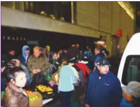
Food and clothing available for the homeless to collect.