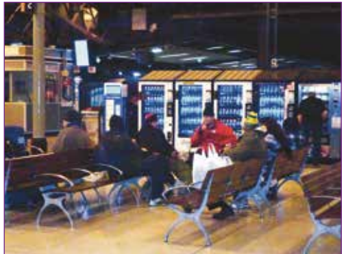
Some of the homeless sheltering at Central Station during the coldest July in Sydney for 20 years.