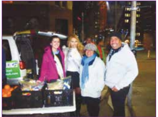
Some of our great volunteers helping to distribute food at Martin Place.