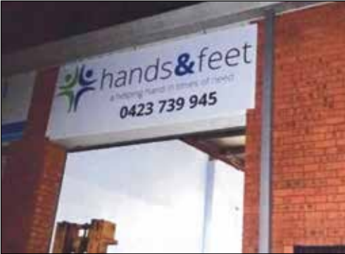
The new sign at the Warehouse in Blacktown.