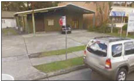
Bet-Nahrain Christian Church for all Nations: