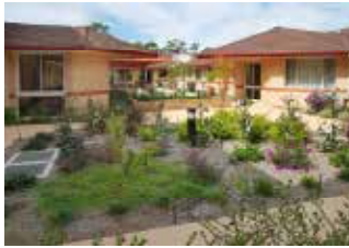
Cherrybrook Christian Care Centre