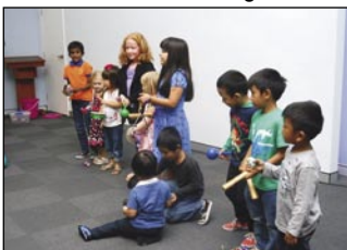
Children's band - Sunday