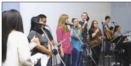
Our Music Team