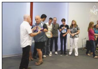
Trivia night prize winners