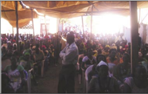
The Crusade, inside the church ▲ and outside ▼

While I was in Burundi, I was asked to conduct a short crusade in the local church at Roziba. My first question was, how could a simple Bible teacher run a crusade? The answer is simple: just stick to the simple message of the Bible, speak well of the Lord Jesus Christ and trust the Holy Spirit to work.