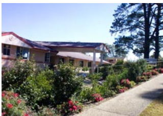
Cherrybrook Christian Care Centre