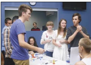
More of Trivia night