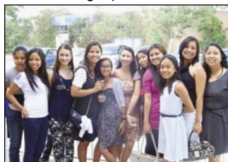
Filipino girls after Sunday worship