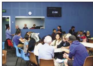
Trivia night - Saturday