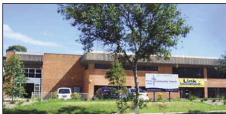
The church building