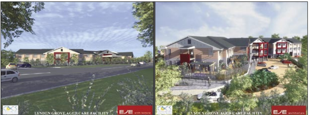
Architects' images of the new Cardiff Heights Aged Care Facility