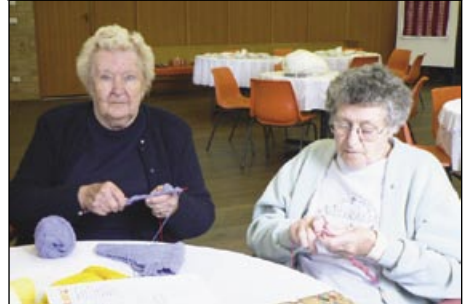
Knitting rugs etc for others