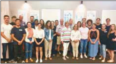
Some of the leaders from our EvangelismSHIFT Group at Riverstone, NSW.

Leaders from 8 churches have been represented in this group in 2018 & 2019.