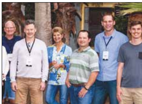
Some current ES facilitators in Australia