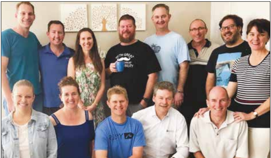
Key Leaders from our Raymond Terrace NSW EvangelismSHIFT Group.