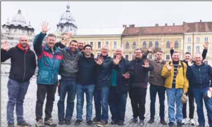
Key Leaders from Slovakia, Romania and Ukraine were trained in the movement-building principles from the life of Christ.