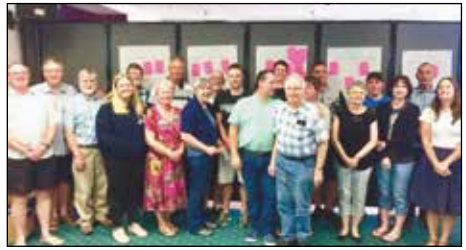
Some of the leaders from our EvangelismSHIFT Group at Mitcham, VIC. Leaders from 3 churches have been represented in this group in 2018 & 2019.

Leaders from 8 churches have been represented in this group in 2018 & 2019.