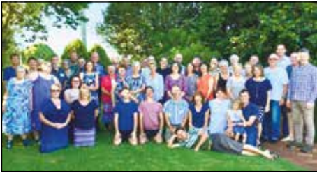
Some of the leaders from our Wollongbar, NSW, EvangelismSHIFT Group.