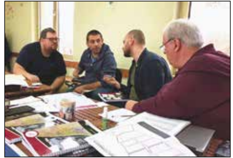
Key Leaders from Slovakia exploring the life and ministry of Jesus and applying His disciple-making principles to their ministry.