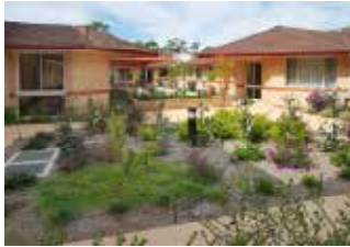
Cherrybrook Christian Care Centre