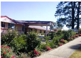
Cherrybrook Christian Care Centre