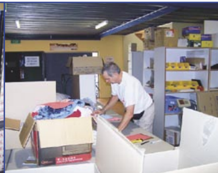
and sorting and packing clothing.