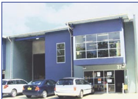
The new base at Dural

Although CMIAid supports fifteen full-time workers in Eastern Europe,