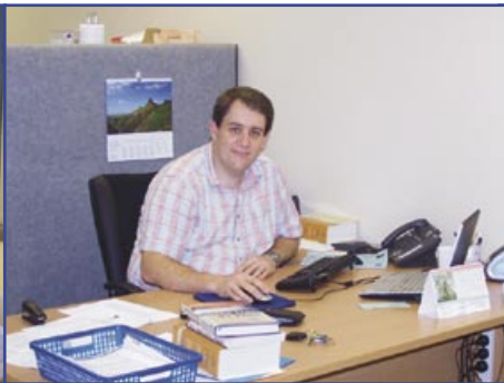
and reporting and writing .....