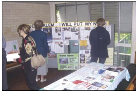
Some of the material and books on display at each meeting

I believe the Lord is using 'Awake to Israel' to grow in His Church a deeper prophetic knowledge of His ways and character, because God wants you equipped to live for Him and understand clearly what He is doing in the world both now and the days ahead.