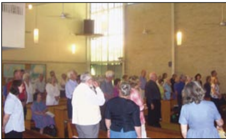
A typical 'Awake to Israel' gathering at Epping Gospel Chapel

The Jewish nation is designed to test and expose the hearts and intents of humanity. Like a threshing floor she sifts our souls. Does that mean everything Israel does is right? Of course not; the test would prove less genuine if issues involving Israel were