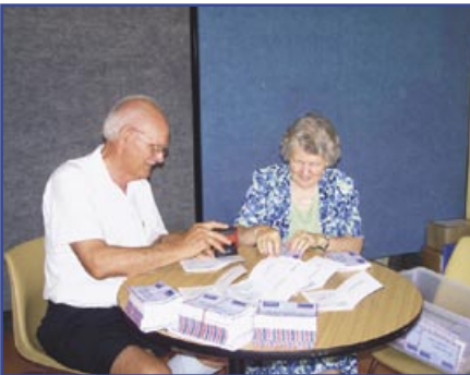
e.g. in preparing literature .....