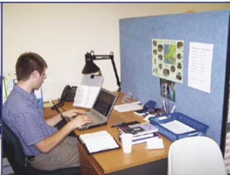
and translating booklets .....